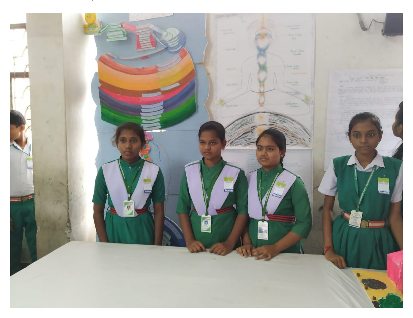
Cellular transformation of Satyavan:-

The ideal attitude towards Time is to develop endless patience, which draws one towards 'Truth's last epitome' where the change expected is an abrupt transcendent miracle. Here one arrives at the brink of vertical time where the law of horizontal time and the law of gradual slow evolutionary change are superseded. To the ordinary consciousness time is horizontal and it moves everything towards slow change. This slow change binds the Soul and is the cause of our inevitable doom. With the growth of consciousness, one becomes quiet and still within, time goes faster and at the highest consciousness of Integral concentration one feels the natural need of silence and contemplative immobility, one enters a Timeless state where everything exists in all eternity and one can live indefinitely without the friction of time. It is only in this vertical time, the change expected is no longer gradual, but it is radical, instantaneous and irreversible. The problem could disappear as pointed out by the Mother, "If the supreme Consciousness truly took possession of the cells and made them live, act, move, like that, so they had the sense of the Omnipotence taking hold of them... This seems to be the only solution."29